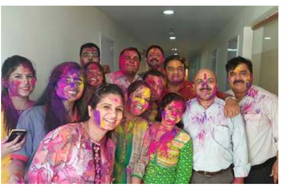
Employees celebrate the festival of colours

Objective – Republic Day was celebrated at both the facilities in Aurangabad as well as in Karjan. The objective of the celebration was to restore the feeling of nationalism and unity among the staff.