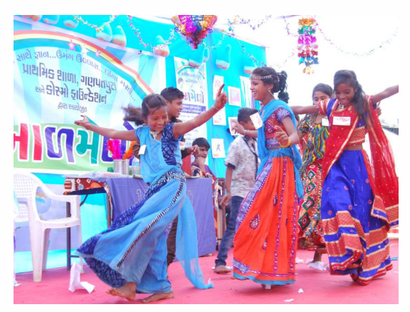
Children present cultural programme