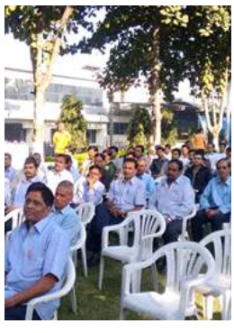
The employees witness the Republic Day function